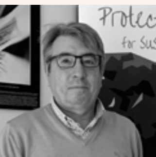
Antonio Troya, Director, IUCN Centre for Mediterranean Cooperation

“The northern Mediterranean countries have a common framework for conservation politics led by the European Union which is promoting NbS and green infrastructures policies at research and project levels. However, it is necessary to create a common space for discussion to bring the southern countries into this dynamic. This will allow more sites to participate and improve their capacity to implement projects at a landscape scale in the region. The joint efforts of several regional organizations working within the framework of the Barcelona Convention help to promote this approach.”