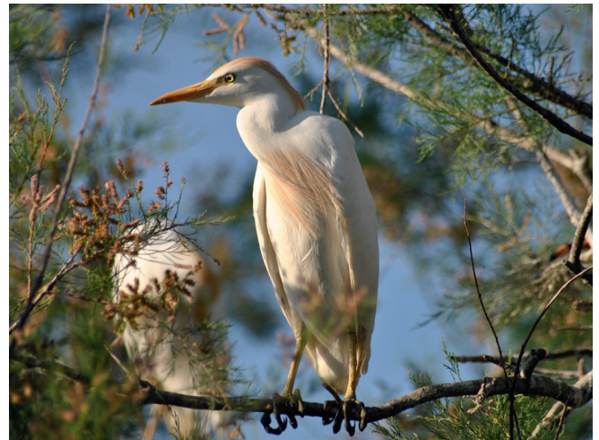
Catille Egret