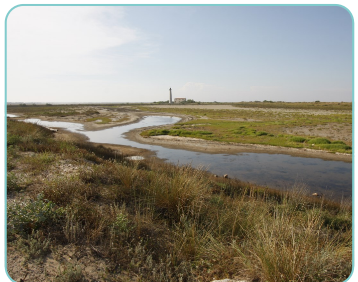
Camargue's Former Saltworks

Two key elements at the 7 th IPBES plenary in Paris will be the Global assessment of biodiversity and ecosystem services, and the new work program. The development of the global report is an amazing achievement, but its results indicate a continued loss of biodiversity and their contribution to people's well-being. Deliverables proposed for the new IPBES working program cover important knowledge gaps, notably the connections between drivers and impacts. However, the policy relevance of the Deliverables could be improved if they would inspire informed action by public, private and civil parties, by including knowledge syntheses on effective actions. Actions such as nature-based solutions provided by wetlands have proven to effectively address drivers and impacts on the current global loss of biodiversity and their contributions to people.