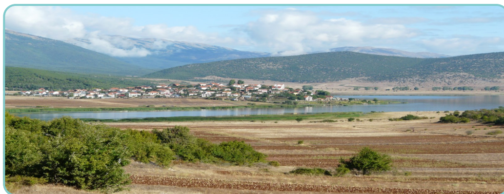
Prespa Lake