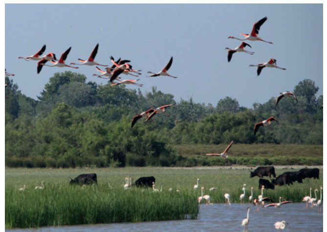
Tour du Valat Estate

PROJECTS IN + THAN 20 MEDITERRANEAN COUNTRIES AND + THAN 300 PARTNERS