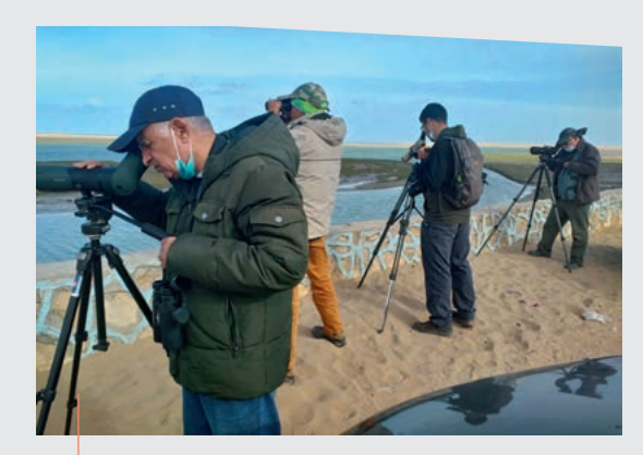
GREPOM travels to the southern provinces of Morocco to provide material and technical support to local associations in order to conduct waterbirds winter censuses