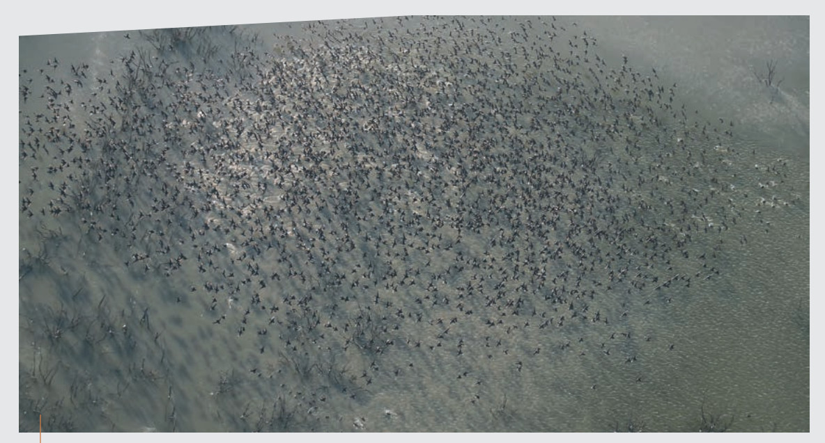
Photo showing the difficulty of estimating groups of individuals during an aerial count in the Camargue. Group mainly made up of Common Teal and Northern Shoveler ducks.

Birds cannot be counted with certainty because detection is always imperfect, making trend calculations unreliable if detection varies too much in space and time. Simultaneous integration of ground and aerial count data into a model enabled us to correct the estimated abundance established by this imperfect detection of individuals, which varies according to monitoring method and bird counter. The resulting abundance estimates better reflect duck population dynamics.