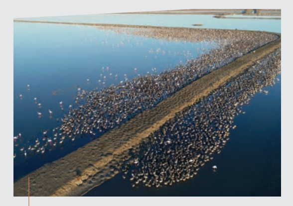
Nursery of Greater flamingos at the Aigues-Mortes Saltwork (August 2020)

Greater Flamingos nested in the salt marshes of Aigues-Mortes with an exceptional reproduction of 21,000 pairs and 16,300 chicks fledged. Spoonbills experienced heavy losses of eggs and chicks due to wild boars. Nevertheless, we were able to limit the damage by installing an electric fence and to exchange eggs with the Netherlands within the framework of a study on deterministic migration.