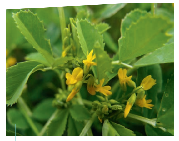
Sicilian Melilot (Melilotus messanensis)

Still on the subject of "birds", another event may have gone unnoticed. Indeed, the long stay in autumn and winter of two adult Kites and a young bird in the south-eastern sector of the Tour du Valat, makes us think that local reproduction is not impossible.