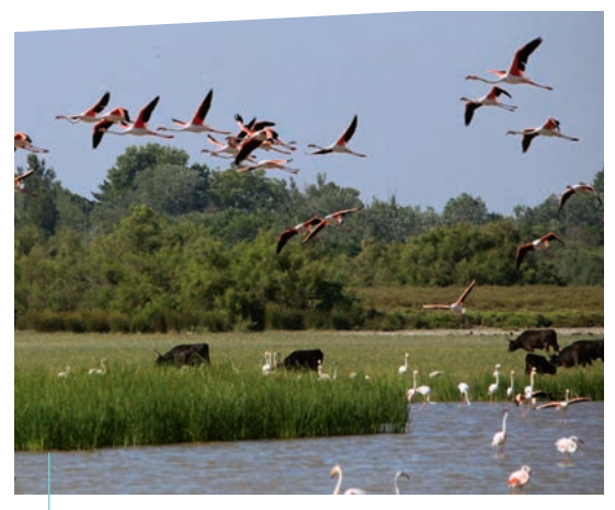
The Tour du Valat Estate

The Tour du Valat also actively participates in the local effort to regulate the wild boar population by organizing hunts, shootings to protect crops, and bow hunting in the most fragile areas.