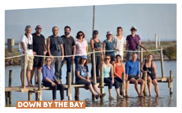
Capitalisation session in Sardinia, with partners from the MAVA Foundation project "Improving the conservation of coastal wetlands".