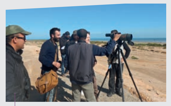
Bird counting and observation training in Tunisia

In 2017, once the North African database had been improved and the scientific articles successfully published, the network chose to gradually open up to ten other Mediterranean countries for scientific exchanges in order to improve knowledge of the status of waterbird populations and monitoring operations throughout the Mediterranean Basin.