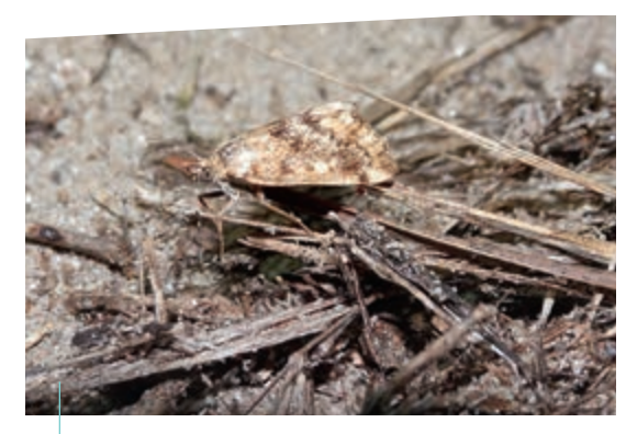
Tegostoma comparalis has only been observed in three other places in France besides the Petit Saint-Jean Estate.

The inventory of microlepidoptera (smaller moths) initiated in 2012 was completed by nione observation evenings: 250 taxa of moths were observed, 23 of which are considered rare, 14 very rare, and two exceptional in France, such as the Tegostoma comparalis .