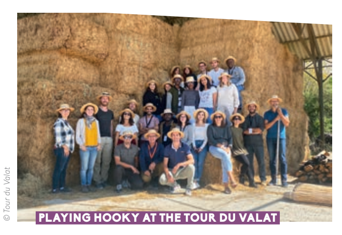
The "Biodiversity and vectors" summer school, supported by the University of Montpellier's MUSE initiative.