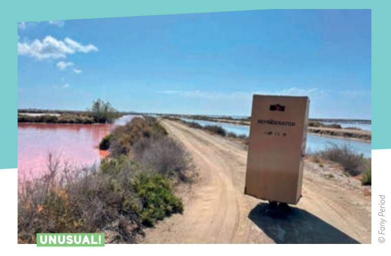
What is this "box on legs" doing? It's trying to become invisible to the flamingos.