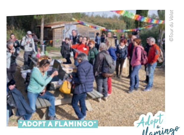
Our team organises activities for the many sponsors who attended the event.