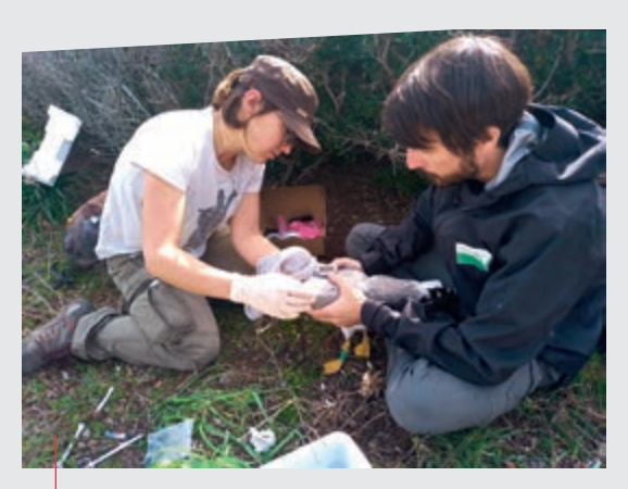
Placing a GPS tag on a Yellow-legged Gull

We contributed to an article on the evolutionary history of the liver fluke. It shows that contrary to the prevailing theory, this parasite did not arrive in America with the European settlers, but much earlier with large wild mammals. In addition, in collaboration with the University of Perpignan monthly field sessions began in April 2022 using new environmental DNA research approaches to describe the diversity of trematodes (the group of parasites to which the liver fluke belongs) in three contrasting sites on the Tour du Valat Estate.