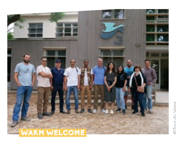
Delegation of the Moroccan Association for Ecotourism and Nature Protection (AMEPN).