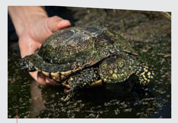
European Pond Turtle

In 2022, as part of Leslie-Anne Merleau's first year of her thesis, a new field campaign was extended to five sites in the Camargue in which a total of 103 blood samples were collected. In addition, a paper analysing the presence of pesticides in turtle plasma samples collected from 2018 to 2020 in the Camargue is currently being submitted. In this paper, we highlight the presence of a wide variety of pesticides circulating in the blood of European Pond Turtles. Bentazone, a commonly used herbicide, was found in the blood of 36% of the turtles sampled.