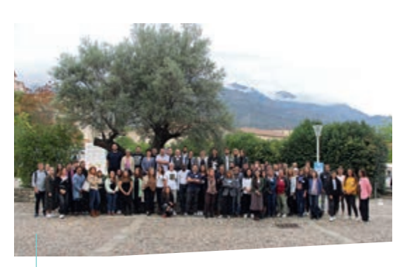
All the participants of the 5<sup>th</sup> International Limnology and Oceanography Days (JILO)

Find the synthesis online: https://tourduvalat.org/en/projects/a-look-back-at-the-ecological-wetland-restoration-training/